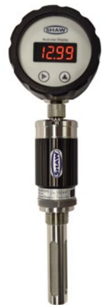
AcuDew shown with AcuLoop plug in display. AcuLoop sold separately.

The Model Acudew is supplied ready to use, with a Certificate of Calibration traceable to National and International Humidity Standards, instruction manual and two metres of cable.